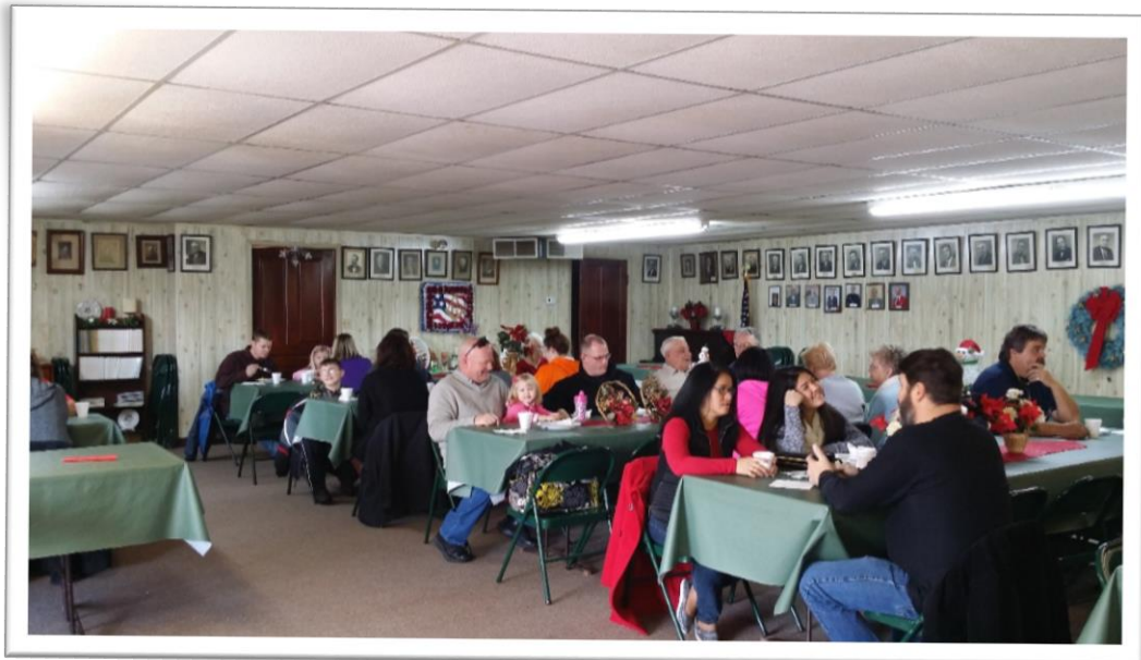
Guests enjoying the pancake breakfast.