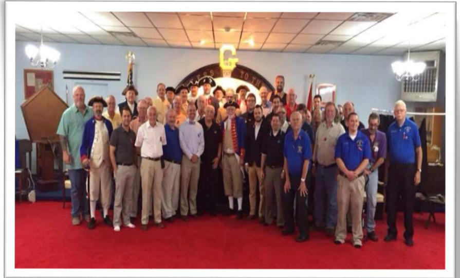
32 Candidates received the Order of the Sword of Bunker Hill

The Sword of Bunker Hill is a Patriotic Order and takes the candidates back to the time of our Founding Fathers. Walk down the streets of Boston and join Paul Revere on his famous ride. The Sword of Bunker Hill provides a shocking perspective to the Revolutionary War.