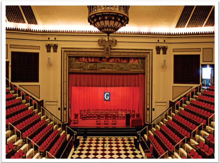
Grand Lodge auditorium in Nashville, TN

Thursday – 8:00 a.m. Grand Lodge completes business and closes.