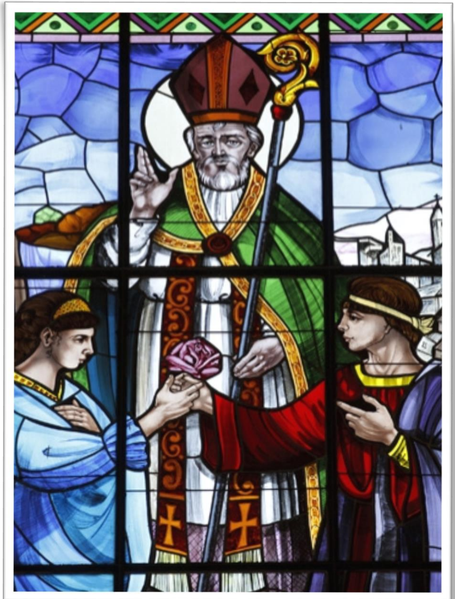
Stained glass image of Saint Valentine performing a marriage ceremony.

Valentine became a Saint sometime after his death. His legend is often mingled with the Feast of Lupercalia, the pagan feast of love. During the feast, names of young women were placed in a box and drawn by men in a game of chance for love. In 496 A.D., Pope Gelasius ended the Feast of Lupercalia and declared that February 14 th to be forever celebrated as Saint Valentine's Day.