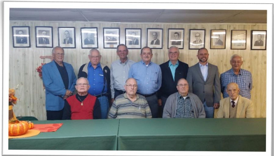
10 Past Masters of Greeneville Lodge and 1 from Beersheba Lodge were in attendance at the annual Past Masters supper.