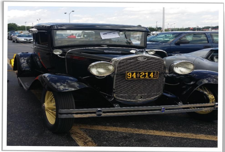
Greene County Scottish Rite Car Show 2016

Greenville Chapter / Council is currently Dark June, July, and August.