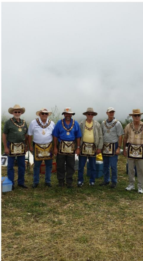
Tennessee Grand Officers