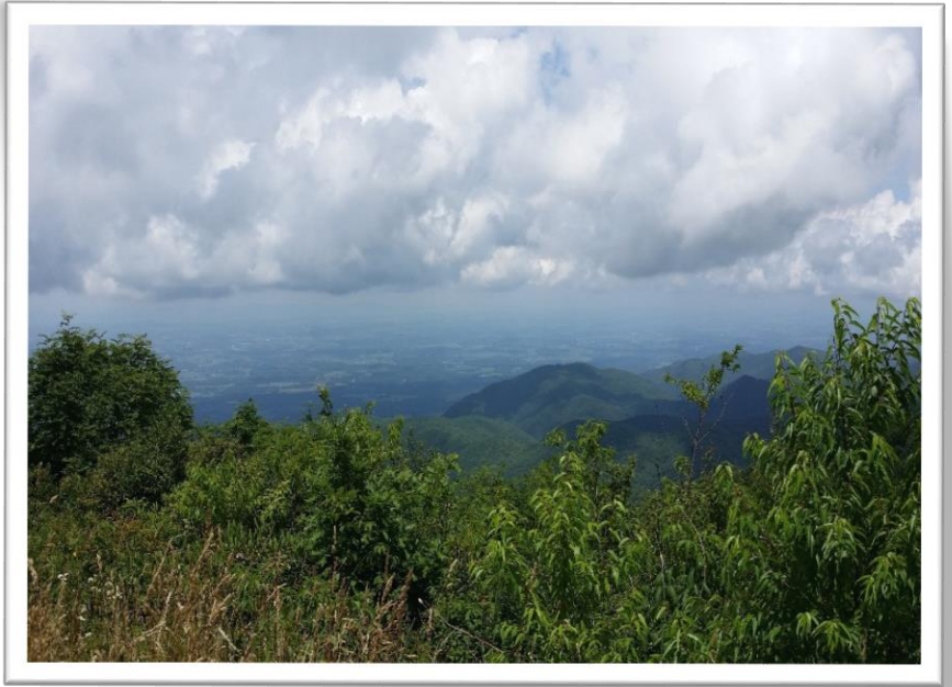
View of Greenville from Viking Mountain

A big thank you is in order for the officers and members of Greenville Lodge No. 3 for making this a successful event year after year. Getting everything that is needed for the event on top of the mountain is no easy task.