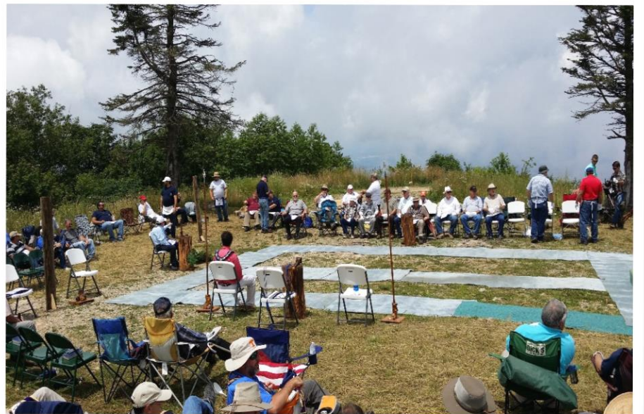
The Lodge Room