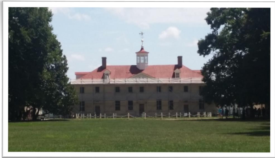
Mt. Vernon – President George Washington's Home

Everything about Jefferson's home was by design. From the placement of certain windows, to open skylights in various rooms throughout the home. Jefferson created his masterpiece on his own little mountain.