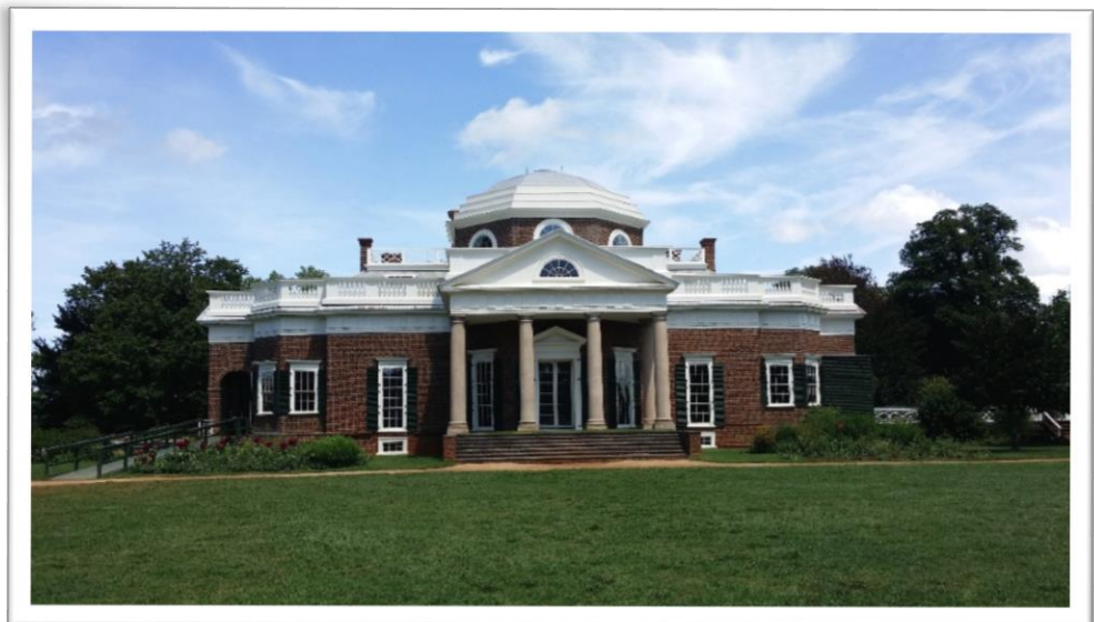
Monticello – President Thomas Jefferson's Home