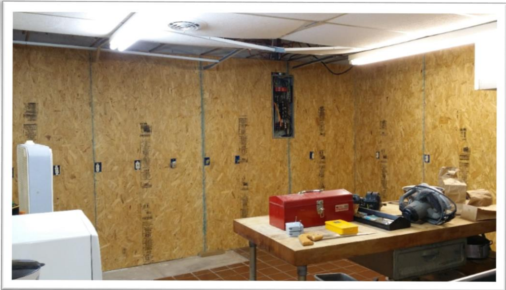
New walls in the kitchen.