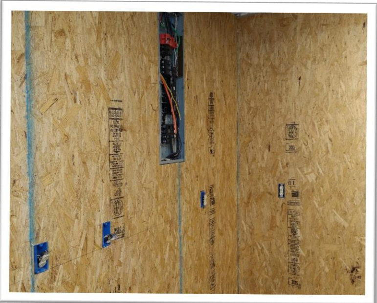
New electrical wiring in place.