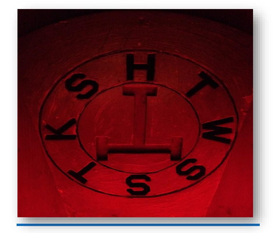
Fall York Rite Festival will be first two Saturdays in November.

York Rite Festival will be held on the first two Saturdays of November in Elizabethton