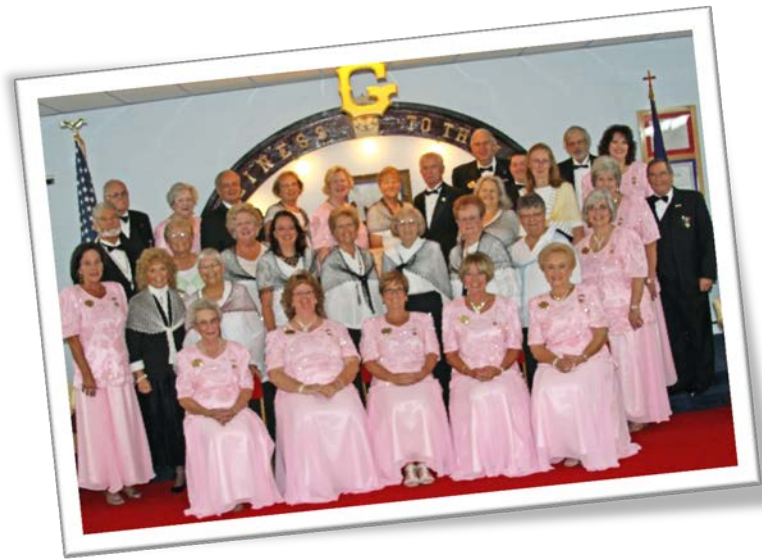
Greeneville Order of the Eastern Star Officers pictured with the Tennessee Eastern Star Grand Officers.

Second Day of the Upper East TN York Rite Festival will be held in Elizabethton on Saturday November 8 th .