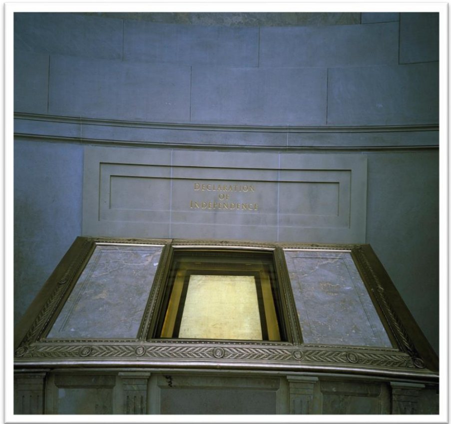
Declaration of Independence

Of the 56 signatures found on the Declaration, 9 were Freemasons. William Ellery, Benjamin Franklin, John Hancock, Joseph Hewes, William Hooper, Robert Treat Pain, Richard Stockton, George Walton, and William Whipple. There has never been any evidence to suggest that Thomas Jefferson was a member. It is possible that others could have been members, but these 9 are the only ones that can be confirmed.