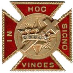
HOLY LAND PILGRIMAGE